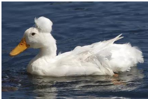
Domestic Crested Duck

Not a wild species, domestic ducks are instead escapees from farms, gardens, and zoos, and they are often kept as pets. These ducks frequently congregate in mixed flocks on urban and suburban ponds. Their indistinct plumage, wide