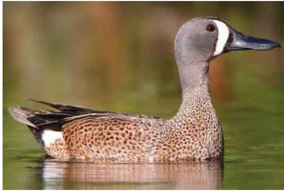
Blue-Winged Teal - Male

Teals are dabbling ducks that often have brightly colored, distinctive plumage, including fantastic speculum coloration. These ducks prefer to feed along the surface of the water as opposed to tipping up, but they will tip up occasionally. Teals are popular with waterfowl hunters, and they are