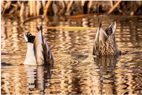
Mallard Pair Dabbling

"Dabblers" are ducks that tip up in order to feed, rooting through shallow water and mud in search of plants and insects. These ducks will also nibble along the water's surface, and they feed readily on land as well, but they very rarely dive below the water. The most common dabbling duck species is the mallard, but the northern pintail, American wigeon, and different teals are also dabblers.